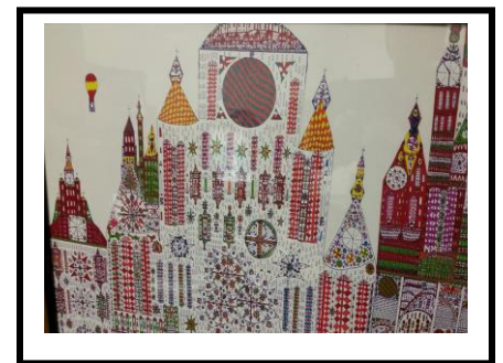
3 rd Place: The New Jerusalem