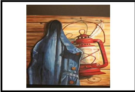
1 st Place: Tribute to Nightwatch