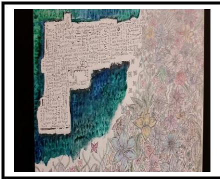
4 th Place: Pull the Trigger