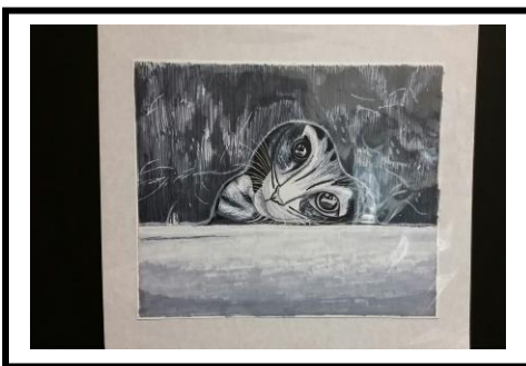
1 st Place: Hiding Cat