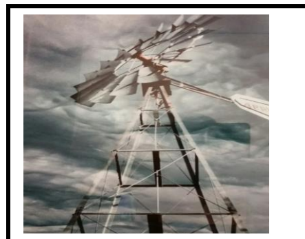
2 nd Place: Storm Coming