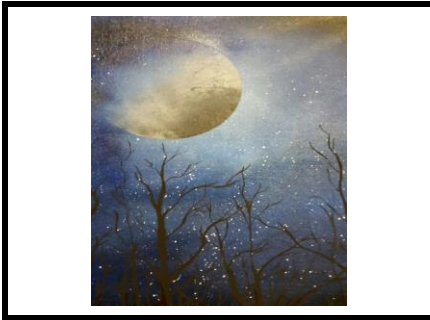
1 st Place: Out of Darkness