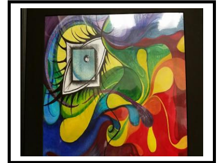
3 rd Place: Inside Out