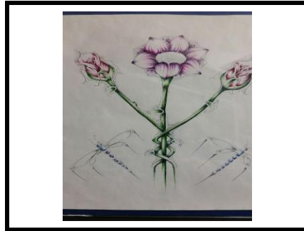
2 nd Place: Blooming in Recovery