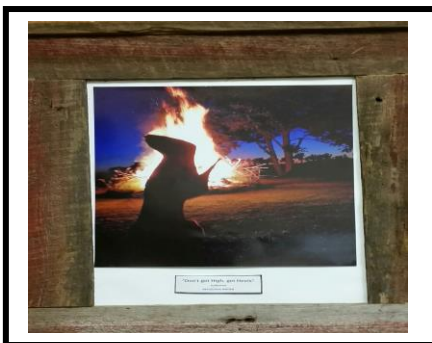
1 st Place: Don't Get High, Get Heels