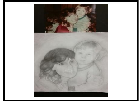
3 rd Place: Christmas 1985