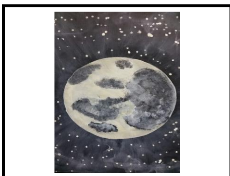
4 th Place: Glow in the Darkroom Painting