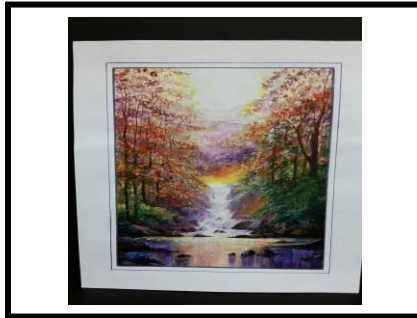
2 nd Place: Sun-Lite Waterfall