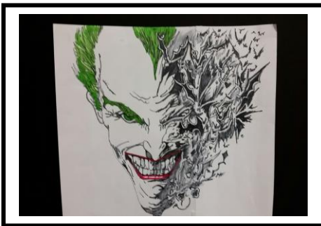
4 th Place: Joker Gone Batty