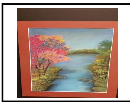
2 nd Place: Our Secret Spot